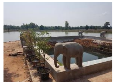
A New Monument Built Beside The Dam. Elephants represent steadfast work, strength, rain and the ability to produce abundant wealth.