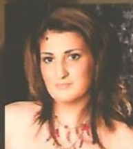
TERESA VEE Hear one of the most distinctive female voices