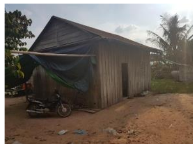
Above: Family Home Prior To Global Grant Below: New Family Home Post Global Grant