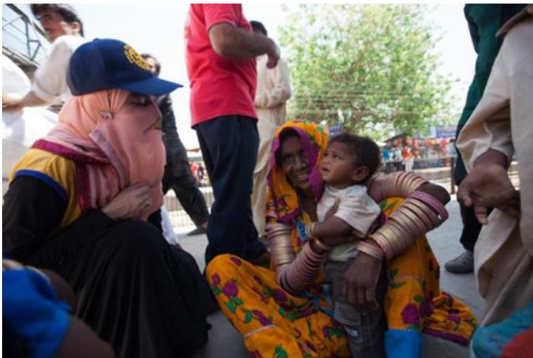
A Rotary vaccination team immunizes children against polio at a railway station in Karachi, Pakistan.

Rotary and the five other winners will be recognized at a ceremony on June in Monaco. Betty Williams, who won the Nobel Peace Prize in 1977 for her advocacy for peace in Northern Ireland, will present the award.