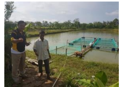
The Farmer Said He Learned To Breed Fish In About 2 Weeks