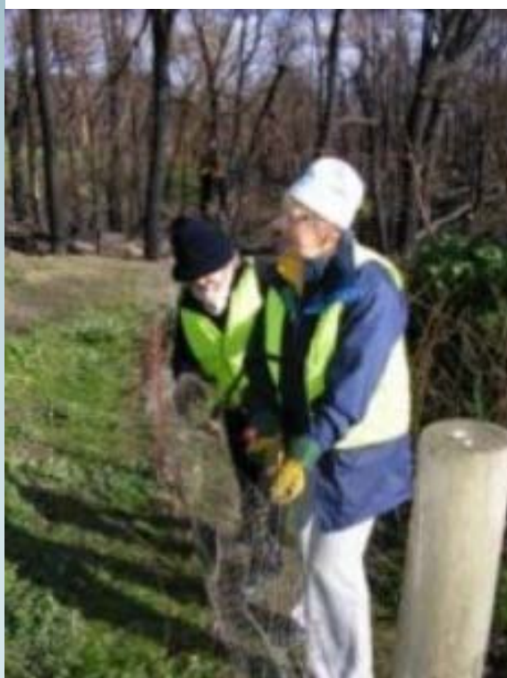
Williamstown Volunteers at work

Several clubs and many Rotarians, their families and their friends have been assisting in removal of fire damaged fence materials and reconstruction of new fences in bushfire affected areas.