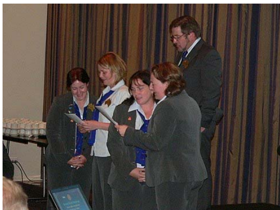
Our Turkish bound GSE Team

Club Membership Chairs and Presidents, Consider emailing or calling your prospective members to wish them a Happy Easter and Invite them along to your next club meeting.