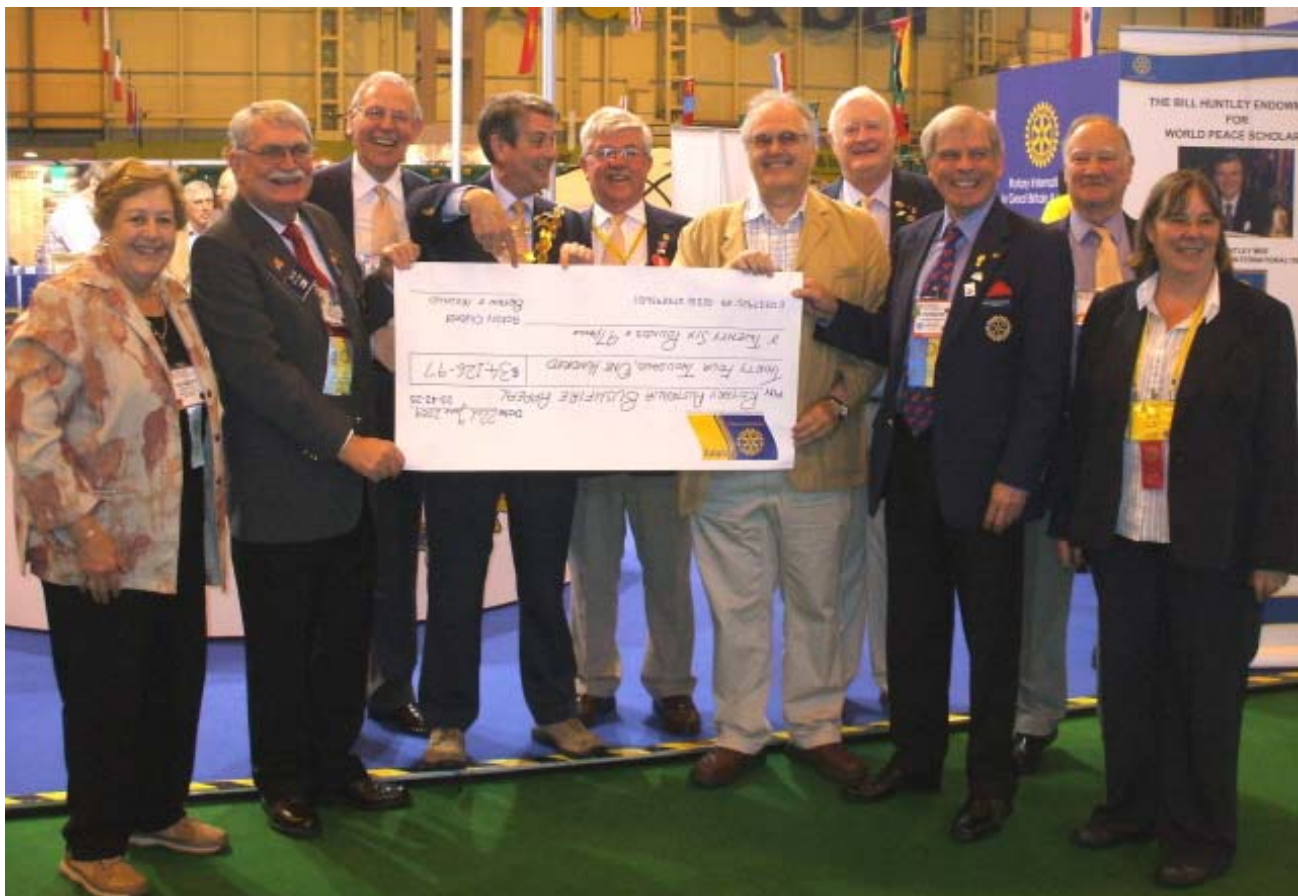
The ‘Down-under’ cheque presentation in Birmingham