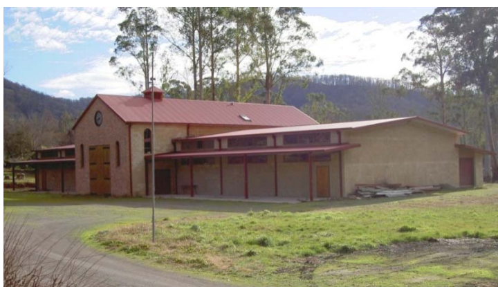
The building at Marysville to be converted into a Business Centre

A major project for Marysville is being developed which is aimed at supporting recovery of business in the Marysville Community which will improve confidence, create jobs, and provide services to residents living in and around the township. It will involve a Rotary contribution of about $300,000 for the purchase of one of the very few useful buildings (previously an auto museum) remaining in Marysville after the fire and its conversion into a business centre. The required funding is likely to come from districts in Victoria and Tasmania with additional amounts required for fit-out and other related works.