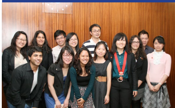
Rotaract Club of Monash/Caulfield