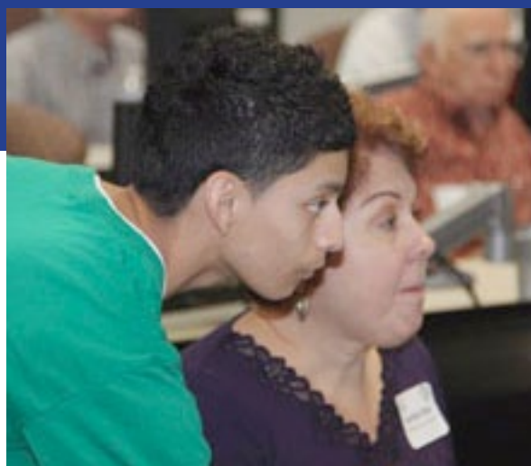
One of the youth instructors helps out a Rotarian during a social media workshop conducted by District 5890 (Texas, USA).

Turn New Generations into the Next Generation of Rotarians: http://vimeo.com/28457109