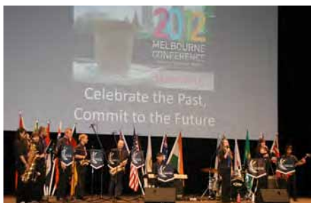
Victoria University Brimbank Campus Stage Band