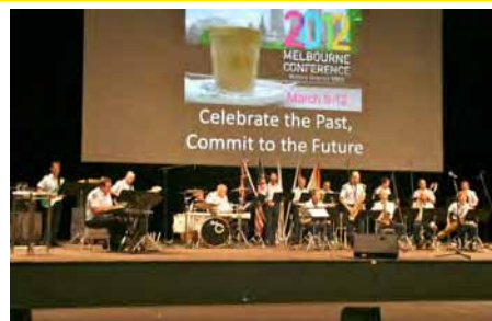
Victorian Police Show Band