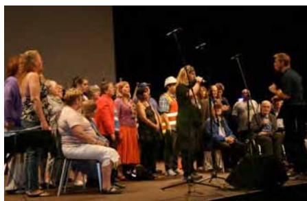
Choir of Hope and Inspiration