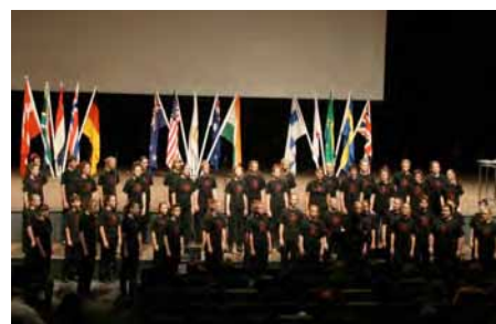
The Young Voices of Melbourne