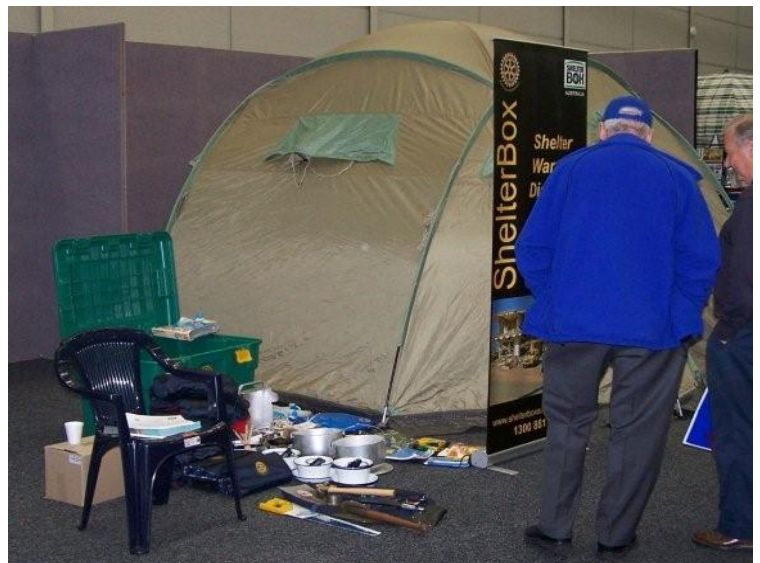
The contents of a ShelterBox always creates interest